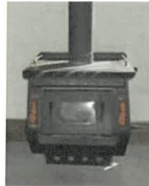
Free-standing non-Environmental Protection Agency (EPA) certified stove