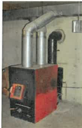
A non-EPA-certified wood furnace (ducted, forced-air, home-heating appliance).