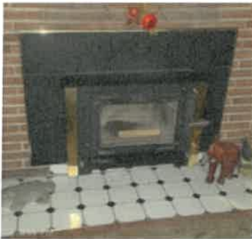
An airtight non-EPA-certified fireplace insert or tube-type heat exchanger with a face plate and door that is installed in an open-hearth fireplace.